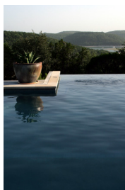
The best way to discover Austin is to start by exploring the town by foot or boat.